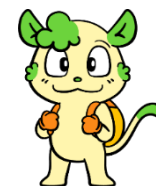
Funwari Fumufumu (Life Safety Mascot)